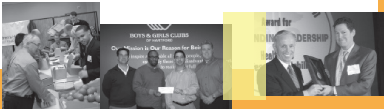
2008 PLUS Foundation Annual Report