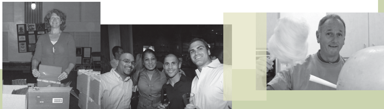
2009 PLUS Foundation Annual Report